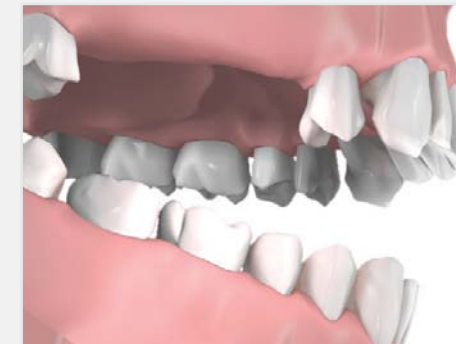
Three teeth missing, upper jaw