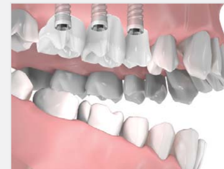
fixed partial denture: final result