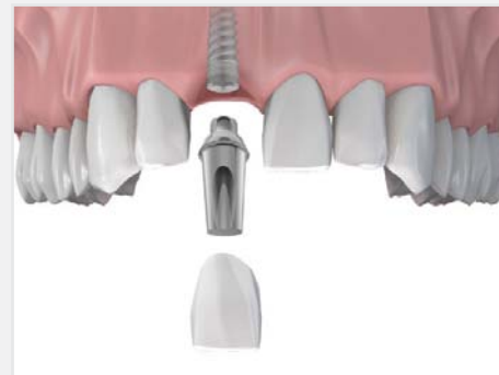
Replacement of a single tooth