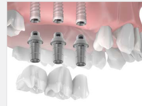
Installing a three crowns on three implants