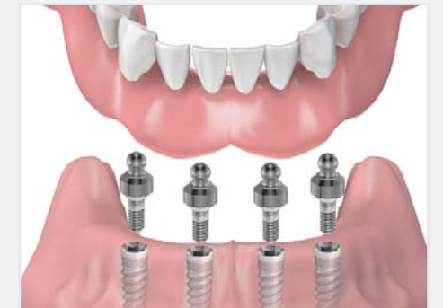
Installing full denture with "Ball attachment"