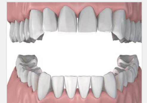
Ball attachment restoration: final result