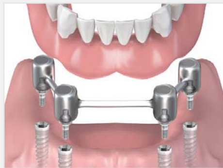
Installing full denture with "Dolder bar"