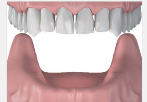
Full edentulous, lower jaw